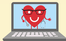
Keep your appointments